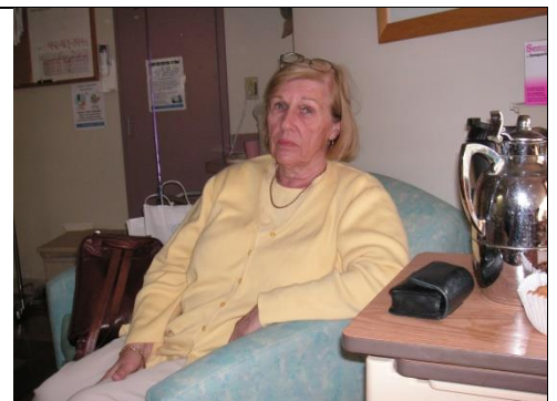
Heide auf Besuch

Freut Euch mit uns, dass Dietmar auf dem Wege der Besserung ist.