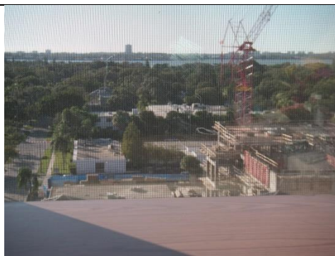
Der Blick aus dem Krankenfenster